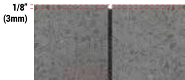
PAVERS OR NATURAL STONES WITHOUT CHAMFER