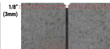
PAVERS OR NATURAL STONES WITH CHAMFER

POLYMERIC SAND REQUIREMENTS Minimum joint width: 1/8" (3 mm) Maximum joint width: 2" (5 cm) Minimum joint depth: 1 1/2" (38 mm)